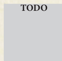
5. Malbleat [C]