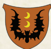
8. Murkin [N]