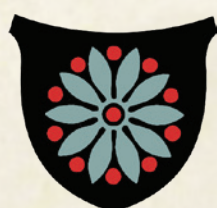
7. Mulbreck [L]