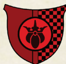
4. Harrowmoor [L]