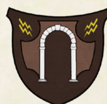
9. Nodlock [L]