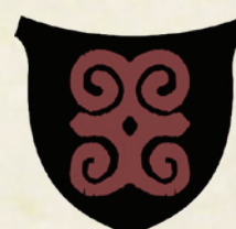
10. Ramius [C]